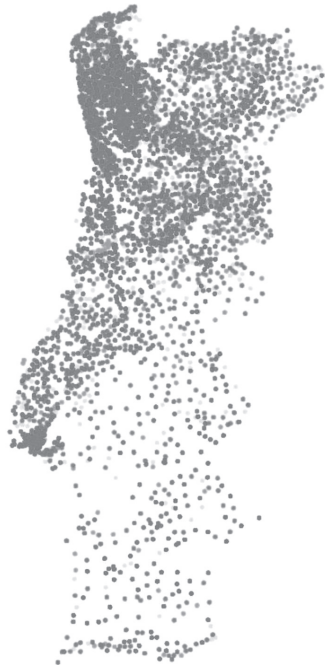
Figure 2 Map of increasing vulnerability assigned to the 4050 parishes.

These scores are depicted in the accompanying map, where each circle represents a parish, and the colors increase from pale yellow to red according to increasing vulnerability (see Figure 2).